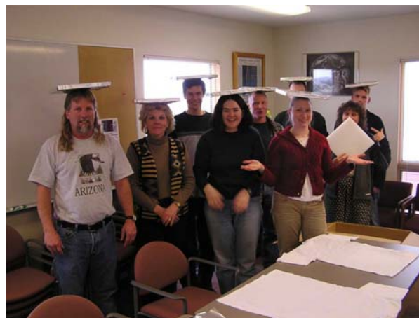
Figure 6. Volunteers at a Hail Pad Making Party

We have recently begun to routinely involve large numbers of volunteers in manufacturing hail pads. Once each month we gather during the lunch hour in Fort Collins and enjoy food and social times while folding, wrapping and stacking hundreds of new hail pads for the coming year.