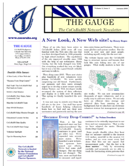
Figure 5. "The Gauge" CoCoRaHS's printed newsletter.

All participants with e-mail addresses and who are interested in our activities receive bi-weekly project updates and weather reports. This listserve was initially set up as a simple means of project communication, but it quickly became the primary method for continuing education. These updates are used to review and reinforce proper observation techniques, to communicate seasonal reminders and to answer frequently asked questions. E-mail updates are used to summarize recent interesting weather events and share information about weather forecasting, agricultural production, water supplies and other weather impacts and CoCoRaHS applications. These e-mail updates are the heart and soul of CoCoRaHS informal education and help maintain the project's sense of "community".