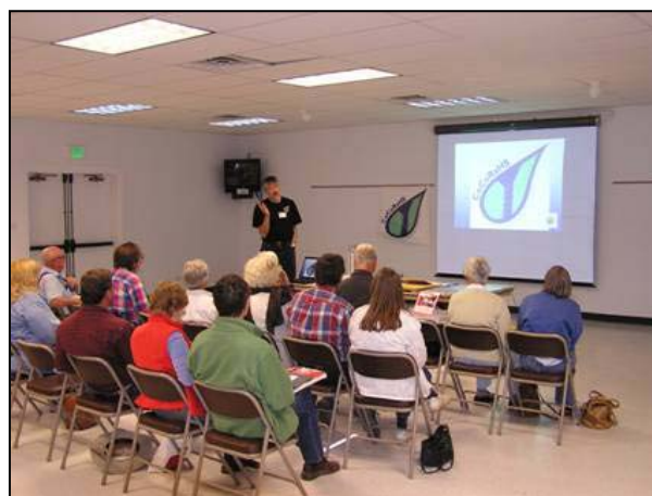
Figure 4. Volunteers attending a CoCoRaHS training session in Cortez, CO.

Volunteers are strongly encouraged to attend group training sessions lead by CoCoRaHS staff or trained trainers. It is also acceptable to read the on-line training materials or view the on-line or CD digital annotated slide show. We are working to implement a simple certification process that will assure that all volunteers entering data on the website have learned the basic elements of observation.