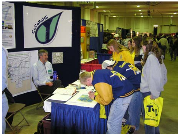
Figure 8. Students learning about CoCoRaHS at the 2005 Colorado Farm Show

When schedules allow, CoCoRaHS staff participate in conferences, educational fairs and festivals and even museum exhibits. We were a part of the Jane Goodall "Make a Difference" exhibit at the Denver Museum of Nature and Science. We attend several children's water festivals each year and also attend Farm Shows, fairs, the Colorado Science Convention, Conservation District Annual Meetings and other similar outreach events. These events also become convenient opportunities to recruit new volunteers to join CoCoRaHS.