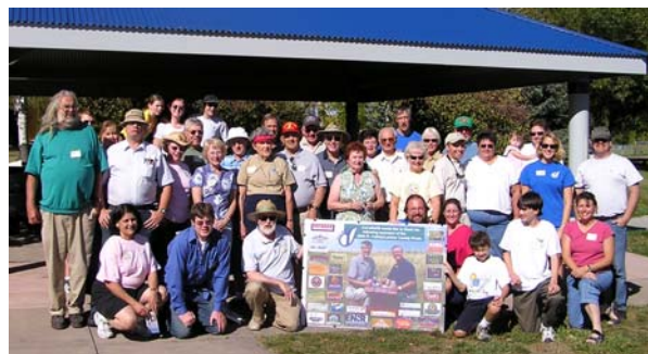
Figure 7. Volunteers at the Fort Collins CoCoRaHS Picnic.

With the help of local sponsor support, volunteer recognition picnics are held annually in some participating states and counties. These are great opportunities to review the goals and accomplishments of CoCoRaHS, highlight the contribution our volunteers have made to make this a successful research and education program, and just say thanks and get better acquainted. CoCoRaHS can be done privately via the computer with little direct human interaction, but whenever possible we try to get together to meet each other, share life and weather stories, and strengthen our community of volunteers.