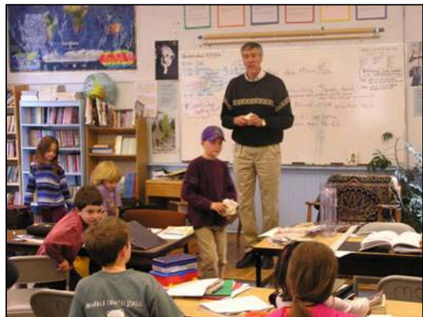
Figure 9. CoCoRaHS presentation at the Marble School in Marble, CO.

Our evaluation results also indicated that the training and support system for volunteers was functioning well and that it was appreciated by the volunteers. In response to the use of CoCoRaHS as a science teaching strategy, two educators in the sample indicated that the program can be a valuable resource for teachers. They reported that they were happy to be able to use a real and relevant science project to teach science as one educator stated: " Being part of a real science community for the kids rather than a simulated class activity. " CoCoRaHS Sponsors indicated that education was the second highest reason, trailing usage of data, that they have supported CoCoRaHS. Finally, in an evaluation of a series of CoCoRaHS training sessions for volunteers given throughout the year, the attendees typically offered positive comments regarding the meaningfulness of their training experience. A typical response was " Excellent in-depth information was provided and I appreciated the enthusiasm. " Learning about the scientific importance of their volunteer work was another noteworthy observation shared by the participants.