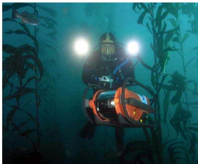
Diver with remotely operated vehicle during telepresence "live dive" in Monterey Bay National Marine Sanctuary.

The National Marine Sanctuary Program and SRF are expanding the telepresence system to other national marine sanctuaries. Efforts are underway to install cameras and a ROV in Florida Keys National Marine Sanctuary. We anticipate this will be complete in the winter of 2005 and will feature images of coral reefs and a tropical marine protected area as well as footage from the Aquarius underwater habitat. In 2006, cameras are scheduled to be installed in Channel Islands National Marine Sanctuary off of southern California, followed by several additional sanctuary sites including a 19th century shipwreck in Thunder Bay National Marine Sanctuary and Underwater Preserve in Lake Huron, and Hawaiian Islands Humpback Whale National Marine Sanctuary off Maui, Hawaii.